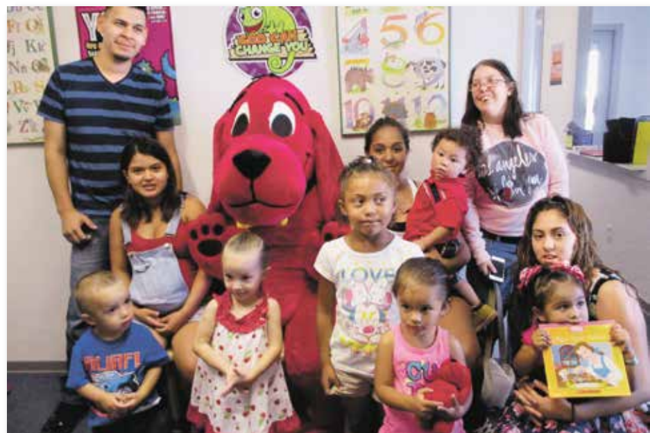
Family First's story time had a surprise visitor late last month: Clifford the Big Red Dog! You can always be amazed to see all the fun we have reading stories, meet new friends and have a snack, every Wednesday at 10 a.m.

If unable to attend one of the sessions please give the Board your input by participating in the online survey: http://centralaz.fluidsurveys.com/s/pressearch2015/ . The survey will be available from Noon on Monday, Oct. 26 through 6 p.m. on Wednesday, Nov. 11. Call 520-494-5406 if you experience difficulties with the survey.