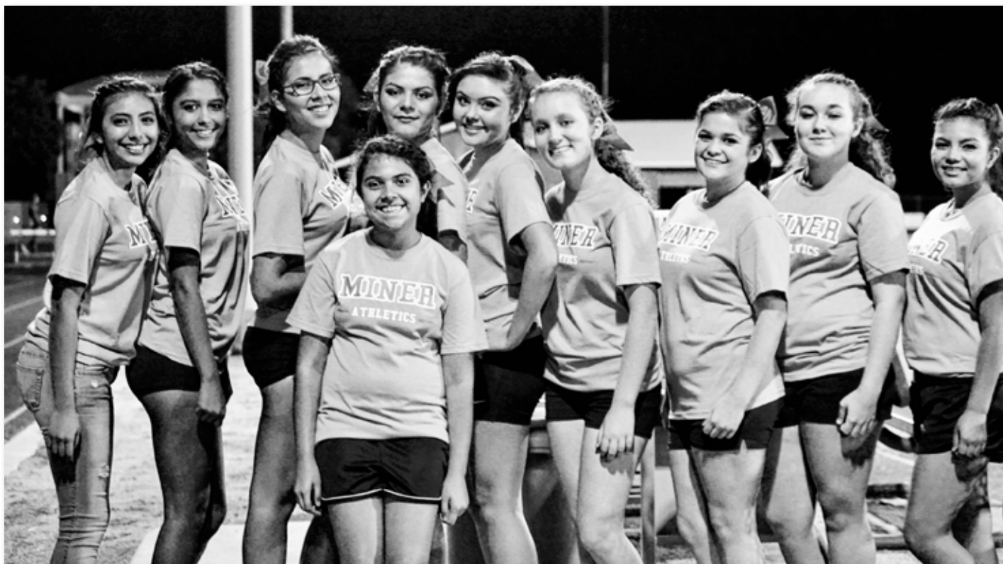
Varsity Cheerleaders are always on the sidelines cheering on the Miners.