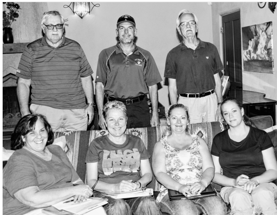
Oracle Schools Foundation members stand ready to serve the district.