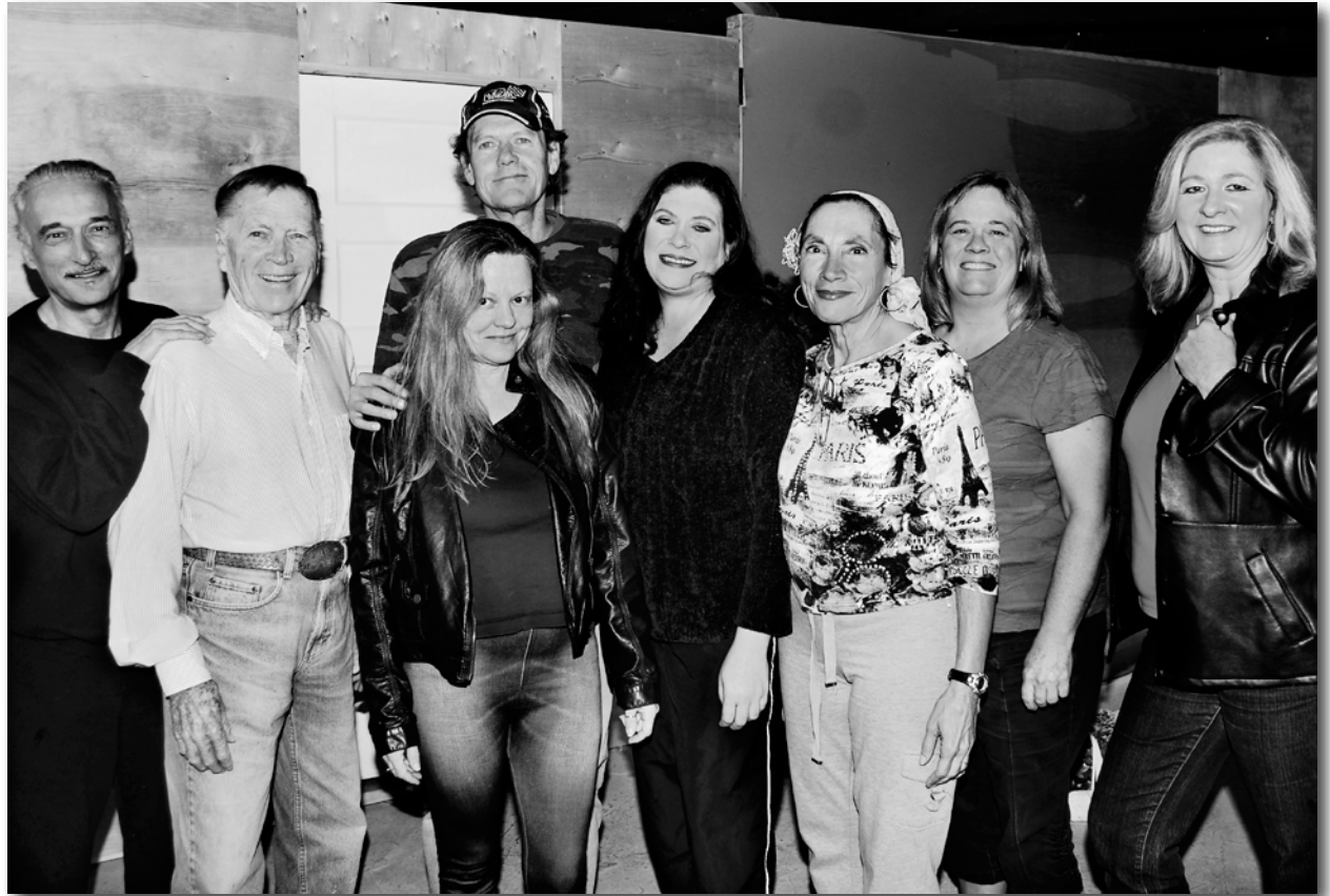
Members of SPATS who will be performing in the play, 'The Actress'. The play opens Nov. 6.