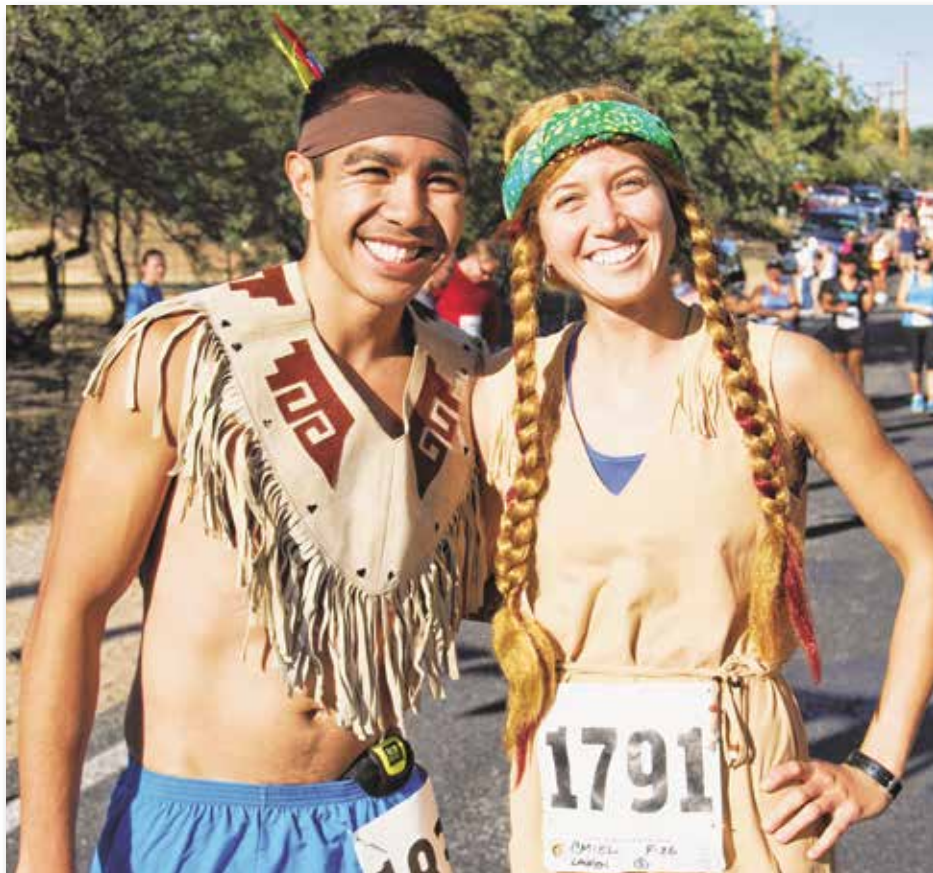
Running in costume is just part of the fun of participating in the annual Oracle Run, a Dia de los Muertos/Halloween themed race set for Oct. 31.