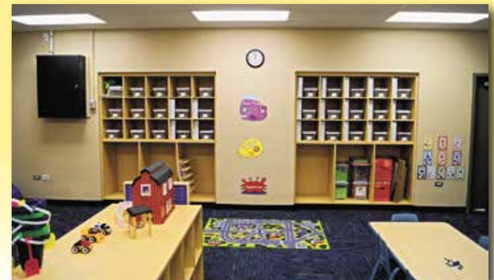
Each room is designed with shelving units like this. Each child is assigned their own cubby.