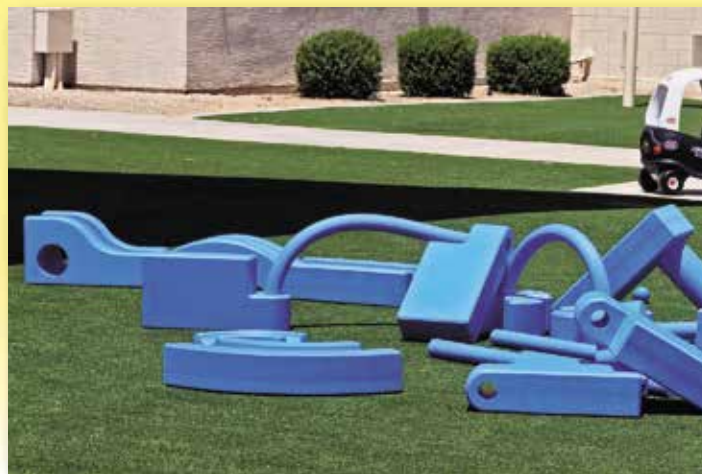
Outdoor play area where children can learn engineering by building things out of these foam pieces.