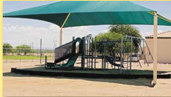
Another shaded playground area on the S.T.E.A.M. Prep Academy campus.