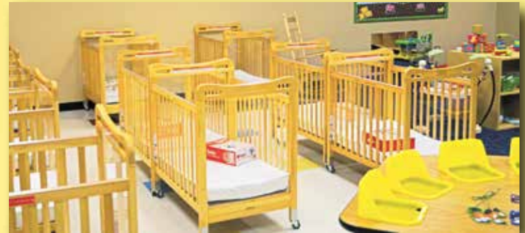
Cribs in the baby and infant daycare room at S.T.E.A.M. Prep Academy.