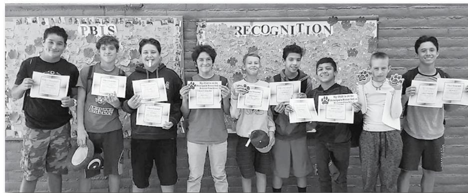
Mountain Vista's scholar athletes – eighth graders were recognized for citizenship, honor roll and principal's honor roll.