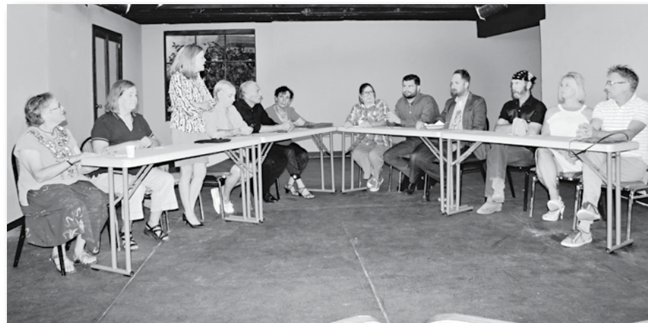
SPATS actors work out the final kinks of their new play, 12 Incompetent Jurors, at the dress rehearsal. The show opens Oct. 29.

matinees at 2 p.m. SPATS Theater is located at 730 E. American Ave. in Oracle. Tickets are on sale now for $15. Donate a can of food at the door and get $1 off the admission. Food is donated to the local food bank. Call (520) 896-9496 for tickets.