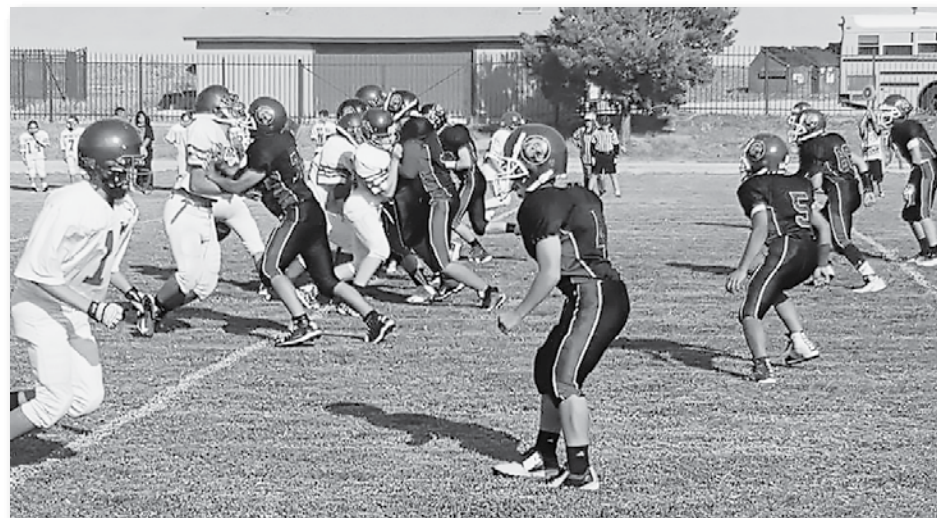
Mountain Vista Cougars on the field.