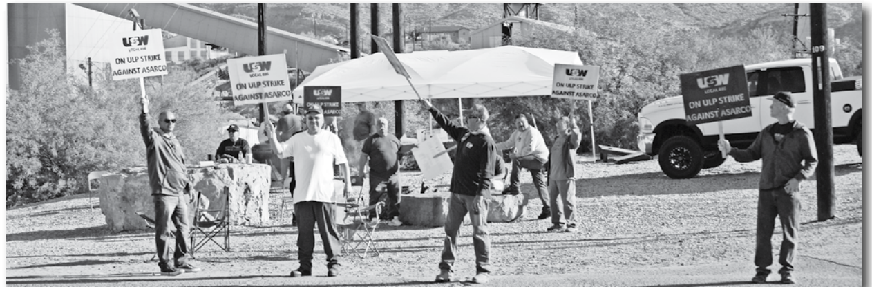
On the picket line near the Hayden Smelter.