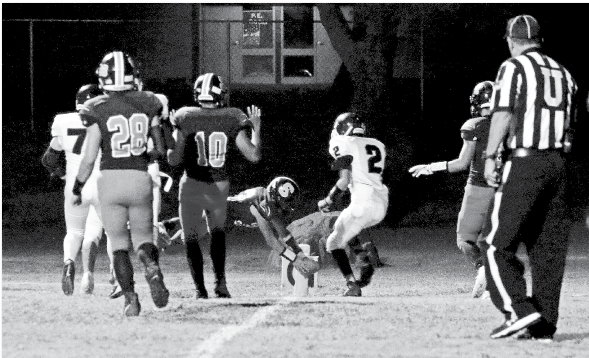
Touchdown for Superior! A Superior ball carrier goes vertical as he crosses the goal line for a touchdown.