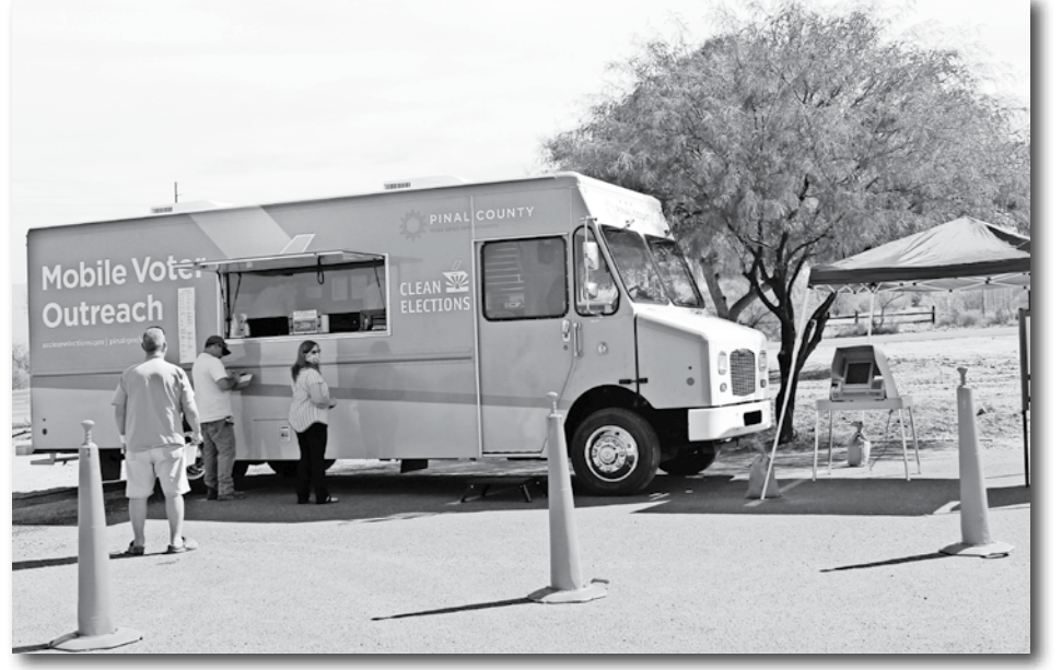
Early voters at the Pinal County Mobile Voter Outreach Van on Monday, Oct. 19, in San Manuel.