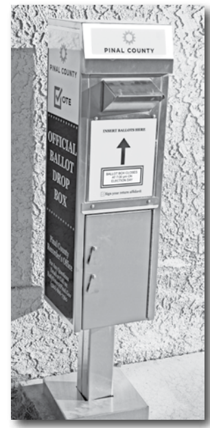
Official ballot box at the Oracle Justice Court.