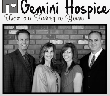
Family Owned and Operated Medicare Part A ~ No Out of Pocket Cost

offenders by two methods. The suspect may be physically taken into the department and booked and release the suspect to appear in court later. All suspects are presumed innocent until proven guilty