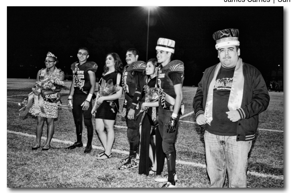
The 2015 Homecoming Royalty were crowned by the King and Queen of 2014.