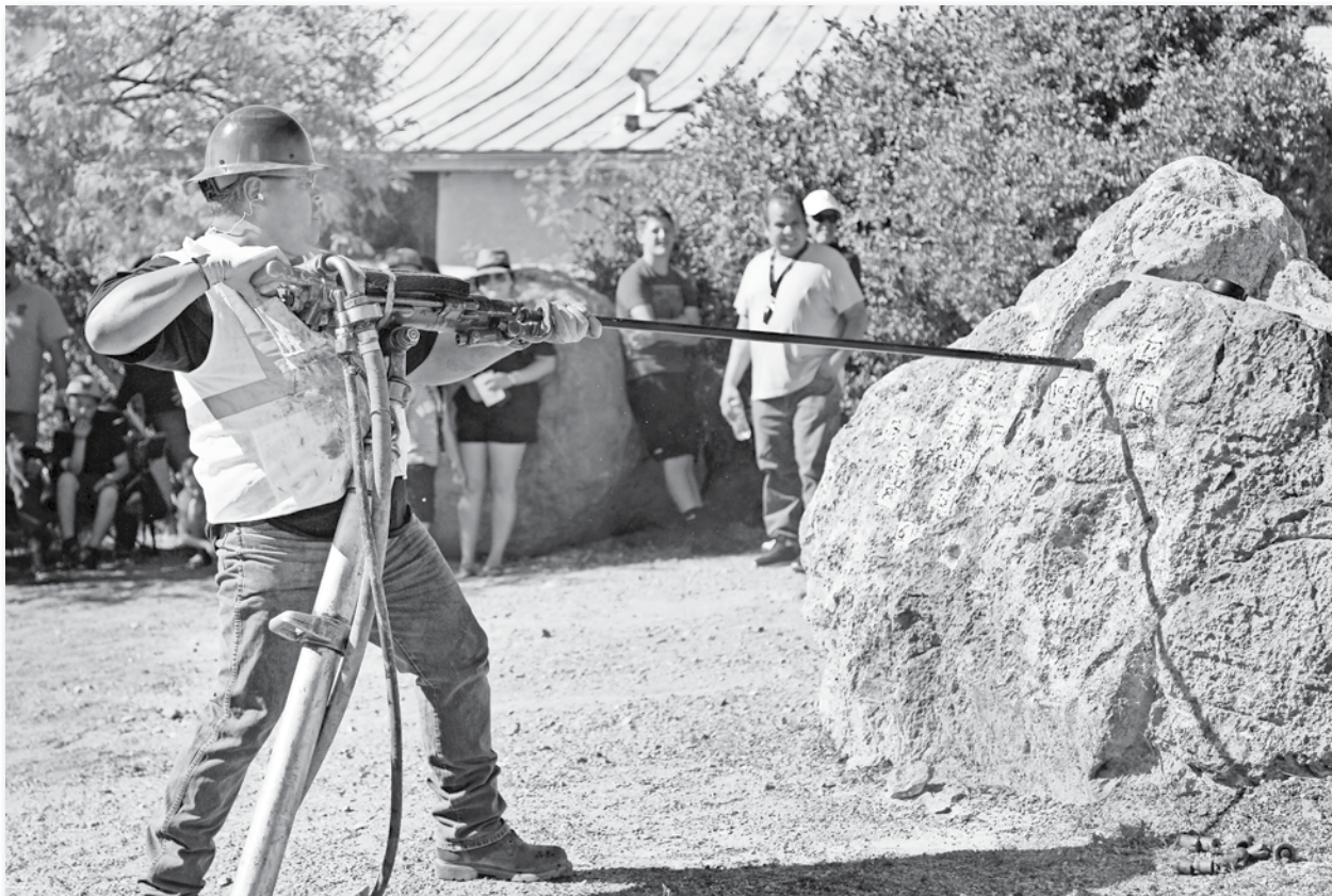
Jackleg Drilling during the Mining Competition at a previous year's Apache Leap Mining Festival.