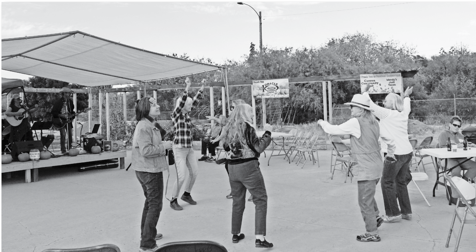
Always good for some toe-tappin' tunes, Mother Cody Band will make a reappearance at this year's Calabazas Festival.