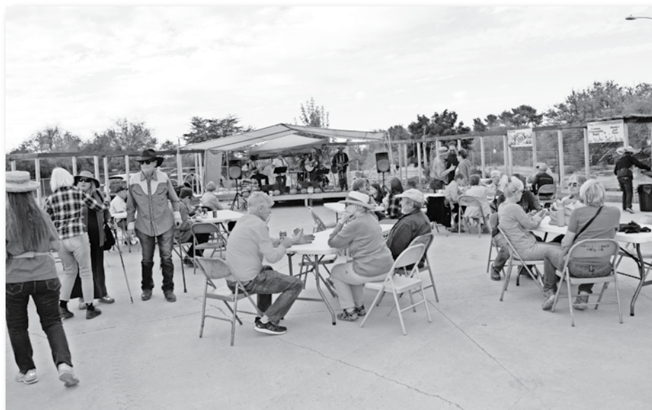
After a pandemic break, the Fiesta de las Calabazas returns to Oracle.

The Oracle Community Learning Garden is located at 1034 E. Mt. Lemmon Hwy., Oracle.