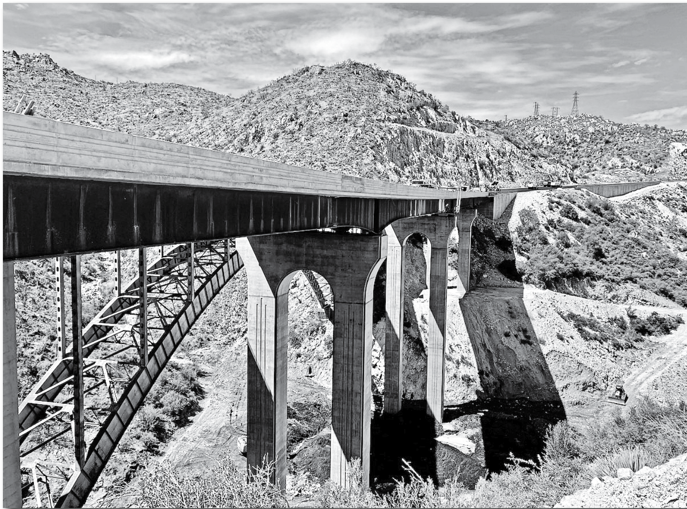
The old Pinto Creek Bridge on US 60 between Superior and Miami, seen here behind the new bridge, will be torn down later this month. The highway will close to accommodate the demolition.