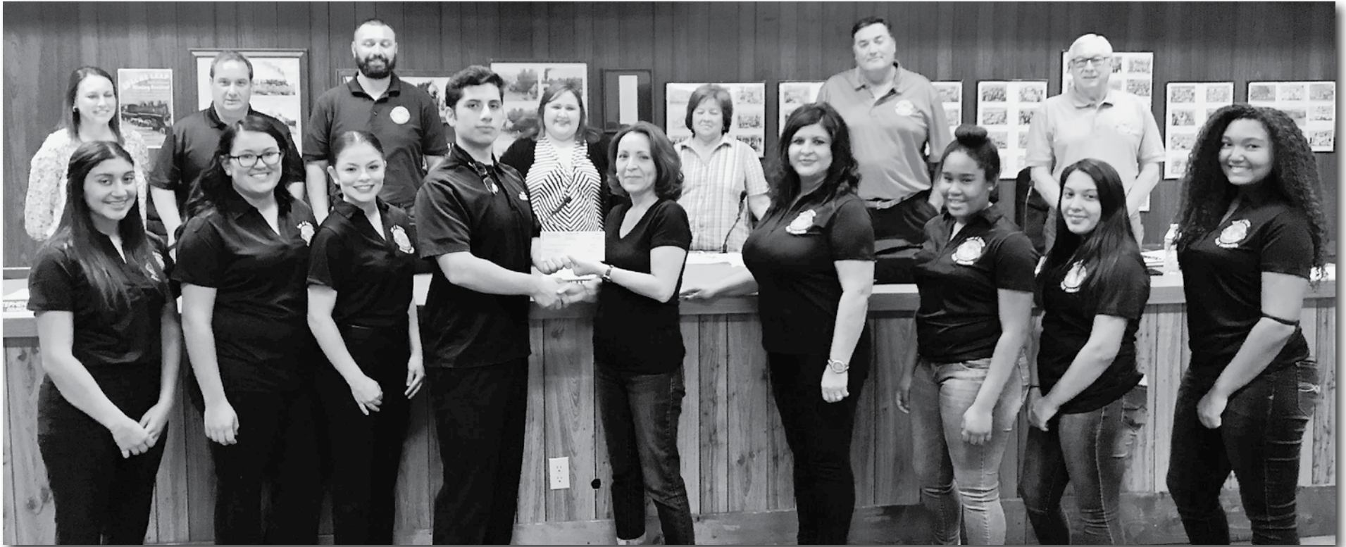
The Superior Town Youth Council presents on their activities for the year at the council meeting. The Superior Youth Council is funded by a $5,000 grant through Resolution Copper to allow the students to organize parks & recreation and other youth activities through the year. This will not only provide more activities for Superior Youth, but will give the Youth Council excellent experience on the workings of government and business.