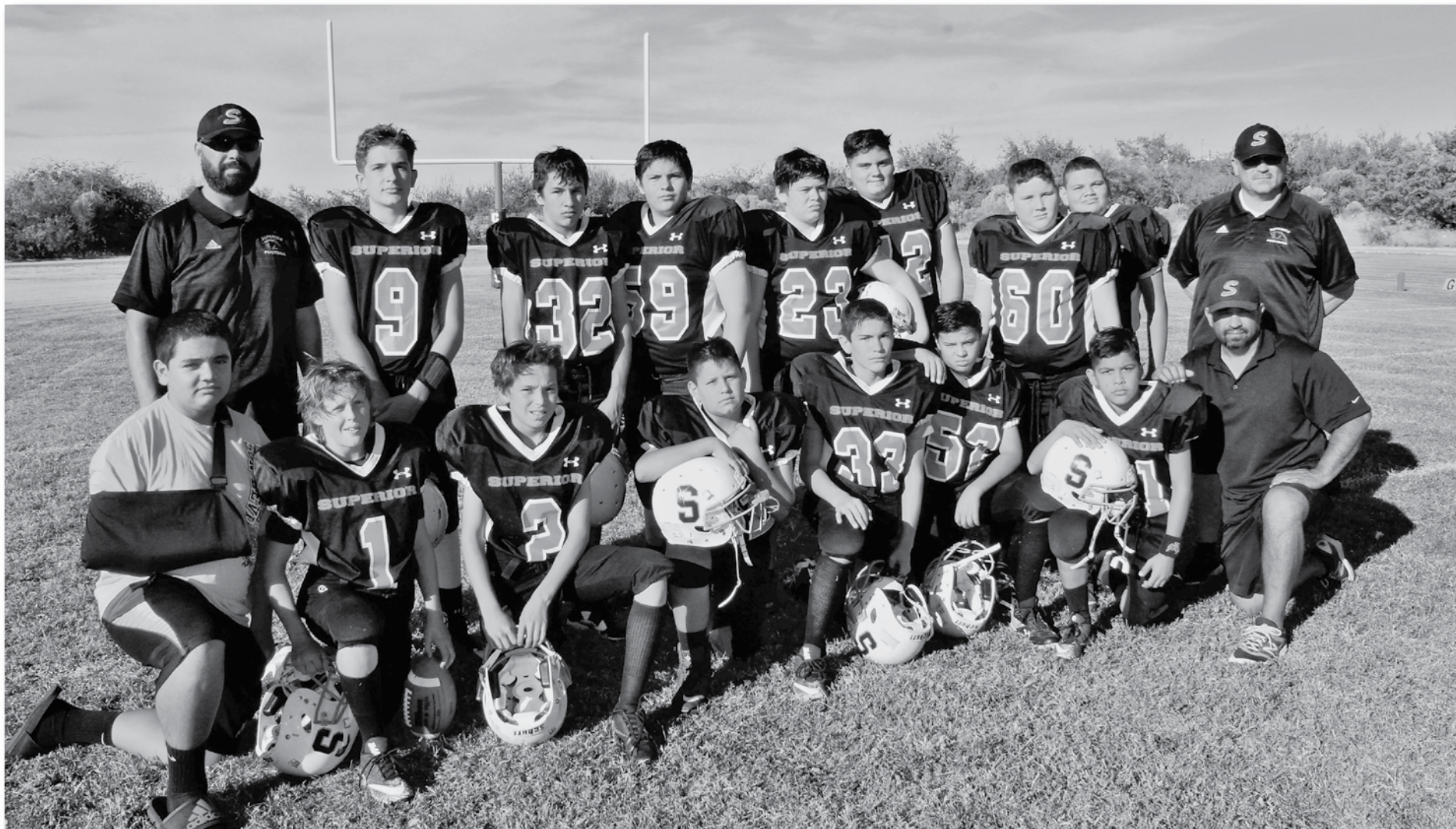
Superior Junior High School Panthers. The boys played in Oracle last week and will head to the playoffs soon.

The second-round game is scheduled for a 6 p.m. kickoff.