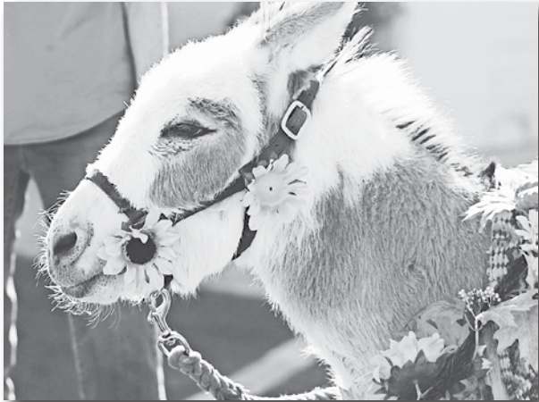
Debi Wilcox | Submitted