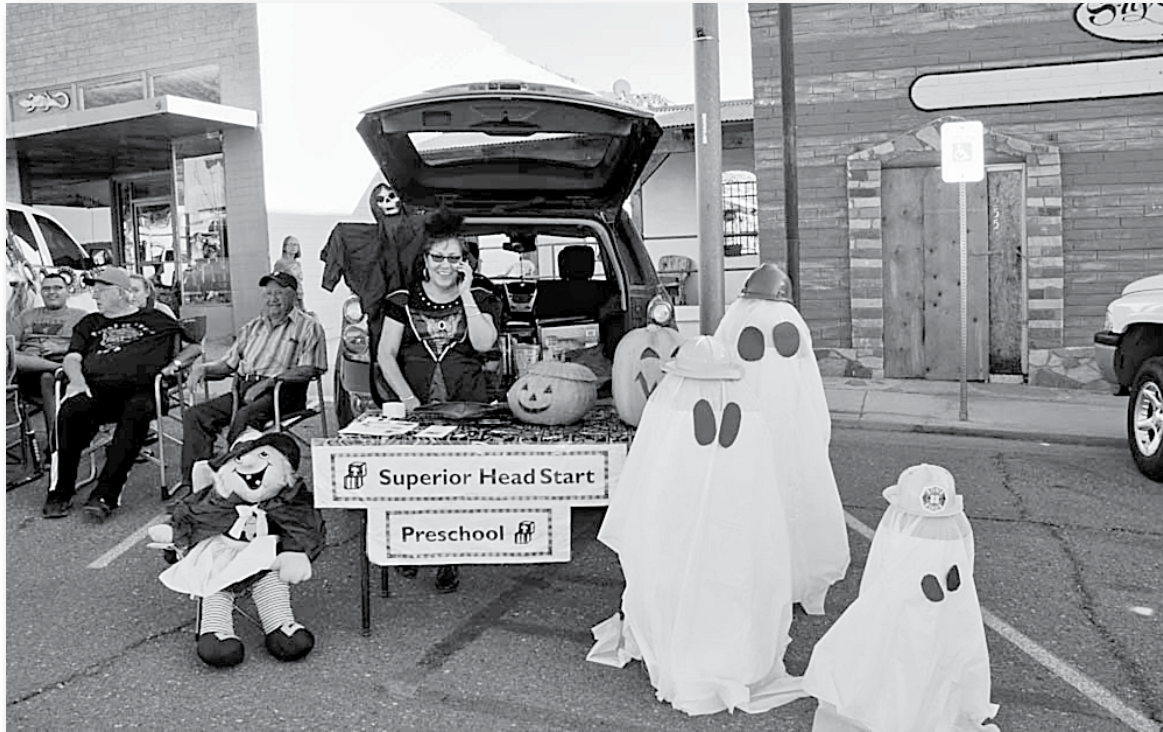
Get your trunk ideas ready for the annual Trunk or Treat in Superior.

For more information on the Halloween Parade and Trunk or Treat please contact Town Hall at 520-689-5752.