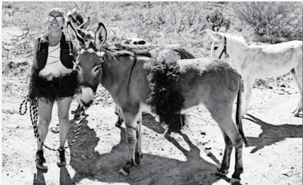
Cat Brown | Superior Sun