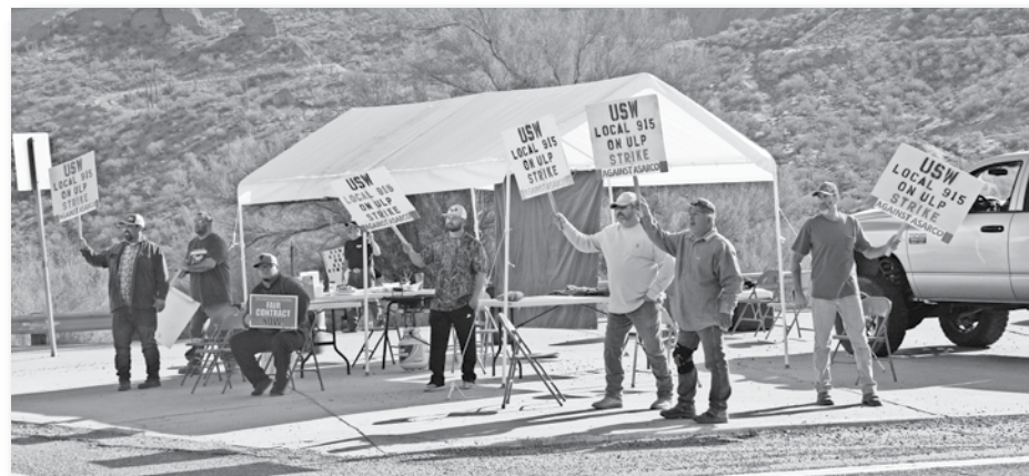
United Steelworkers on the picket line near the Ray pit.

ASARCO is a major contributor to the economy through sales tax collections, property tax, mineral severance payments, materials and equipment purchases, and employee wages, salaries, taxes and benefits."