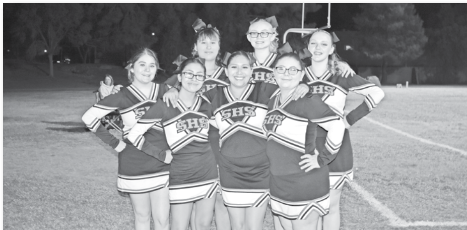
Superior’s cheerleaders – they’ve got spirit!