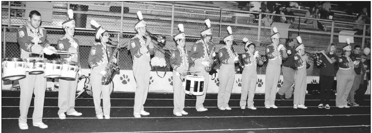
Ray High School Marching Band.