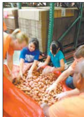
Students helped sort through over 25,000 lbs. of potatoes.