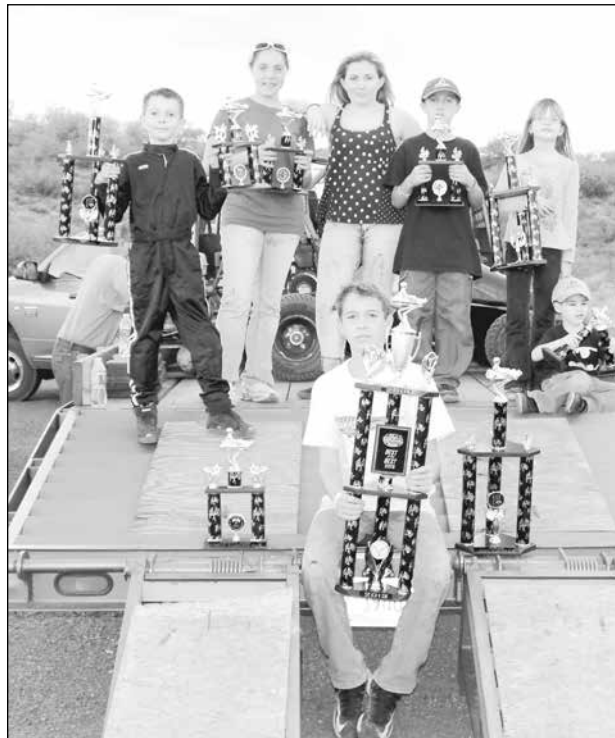
Gila Monster Go Kart Racers.

If you haven't seen Go-Kart racing, you are missing out on a great time. The season begins in April and ends in September, with three classes; beginners, ages 6 -11 and ages 12-18. Spectators are free and pit passes are $5 per person. The entry fee for drivers is $15. The 2013 season ended Sat., Sep. 21, with Kearny racers finishing on top.