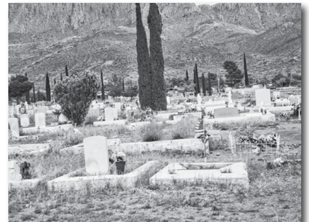
The Superior Cemetery needs some love and care. The Council and friends plan a clean up on Oct. 31 and Nov. 1.