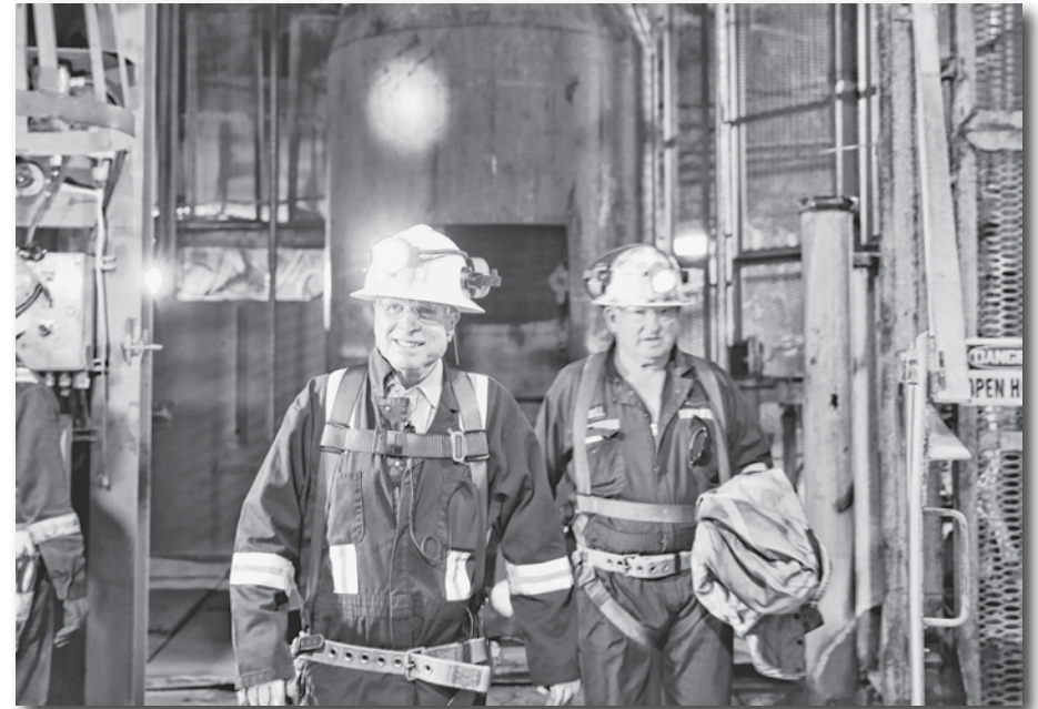
Senator John McCain arrives underground at the Resolution Copper project.

and write about the present operations and the future opportunity the mine can bring to our community and region, the long awaited trip has made an even larger impact taking the journey with Senator McCain. The tour provided a new perspective of what the miners of our community go through on a daily basis.