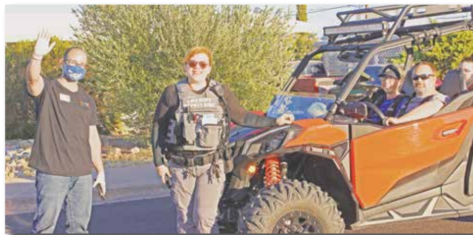
Some of the civilians and Pinal County Sheriff's Deputies at the police parade in San Manuel.