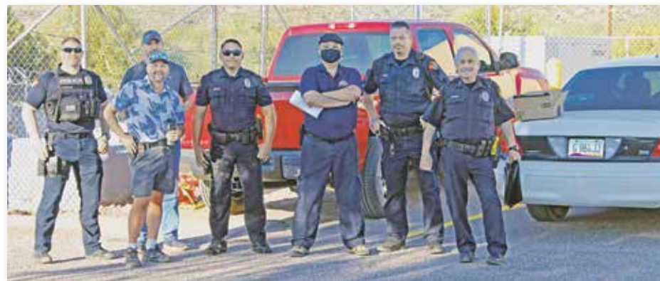
Mammoth Police prepare to leave for the parade through town.

The CCSAC meets monthly to coordinate efforts to reduce substance abuse amongst young people in the Copper Corridor. They operate under the umbrella of the Arizona Youth Partnership. Follow their page on Facebook to learn more about their meetings and activities: https://www.facebook.com/coppercorridorcoalition or call them directly at (928) 425-9276.